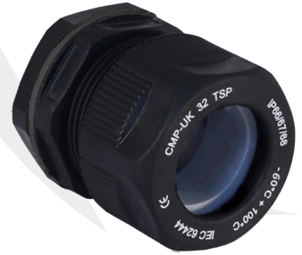
shown in black with standard seal and locknut