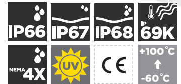
Product tested to IEC 60529, equivalent NEMA ratings shown for comparison purposes.